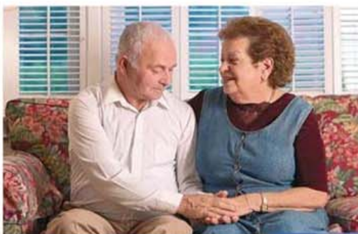
Encourage loved ones to participate in a driving assessment program for their safety and the safety of others.

There are, however, situations in which the older driver may not realize that the physical, visual and cognitive changes that have occurred may affect their driving skills. Certain medical diagnoses such as Alzheimer's disease and dementia affect a person's capability of having that insight and the